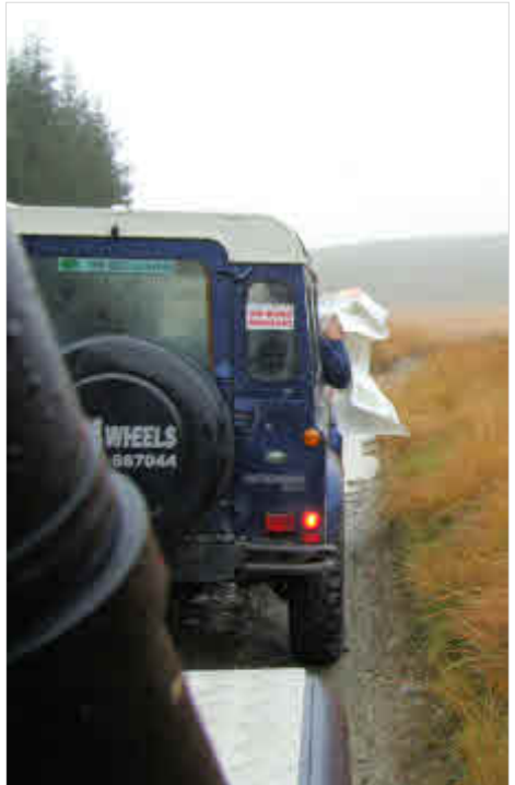
What to do when the map gets too big for the car