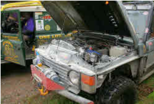
The Twisted Firestarter Strikes in Ireland