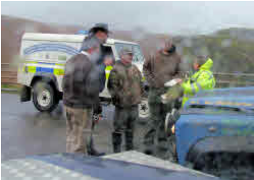
Wales 2007 "The Full Story"